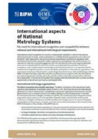
Insert 2: International aspects of National Metrology Systems