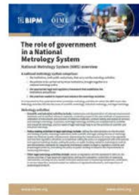
Insert 1: The role of government in a National Metrology System