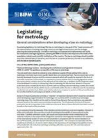
Insert 5: Legislating for metrology