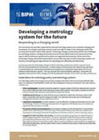
Insert 6: Developing a metrology system for the future