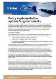
Insert 4: Policy implementation options for Governments