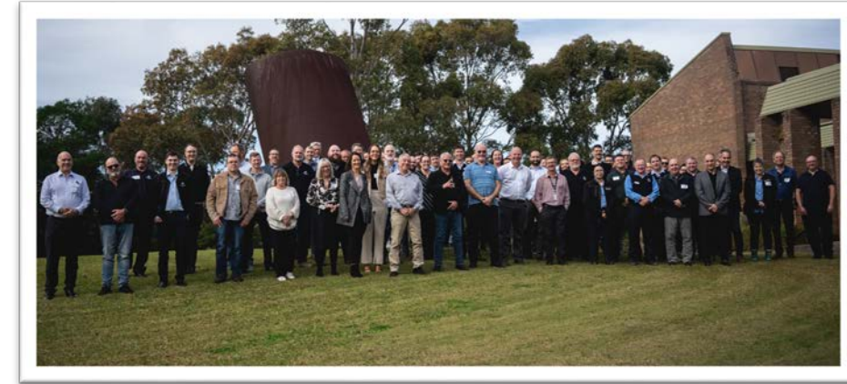
My Team - 2023